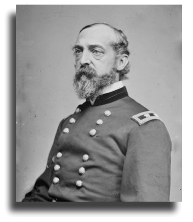
Maj.Gen. George Meade

What is more important than a figure ratio is the relative frontage of the represented unit; this goes hand in hand with the selected ground scale. Essentially every inch or millimeter of a tabletop unit frontage represents a certain number of men, relative to the formation and number of ranks and files represented by the unit. Representation of unit formations on the tabletop is generally a compromise, particularly when considering columns and square formations, where the physical footprint or width is not a true reflection of the actual historical formation. The basic line formation frontage, however, should be as relatively accurate for gaming purposes as possible, and especially consistent across the units represented on both sides of the table. Using this principle, the charts on the previous pages, are provided as guidelines to typical unit frontages represented within the army lists. However, it is not necessary to rebase your existing collections to suit